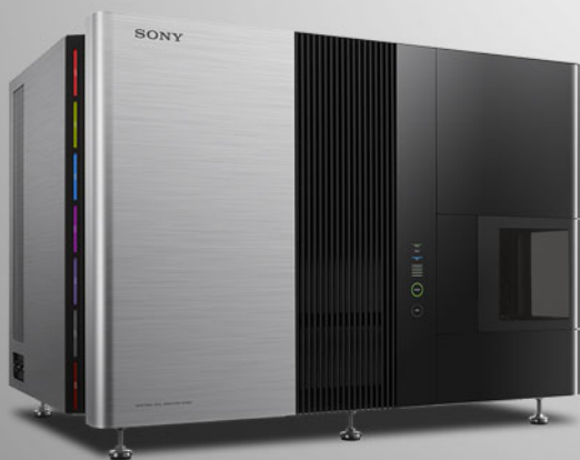
ID7000™ Spectral Cell Analyzer

Learn how the ID7000 Spectral Cell Analyzer has empowered biomedical research